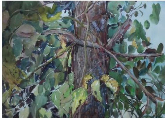
Susanna Anastasia – Best In Show Red Oak with Butterfly