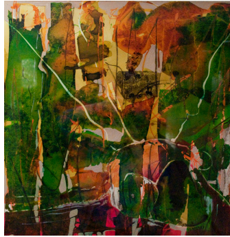
Isabella Pizzano - Rainforest Honorable Mention

call now 1 800 537 0944 Mon. - Fri. 8:30 am-6 pm www.americanframe.com *out our on-line specials