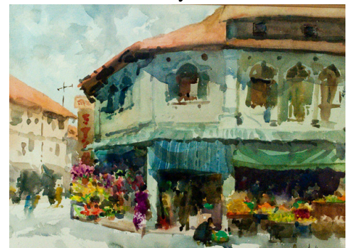
Amelia Chin - Street Scene in Singapore