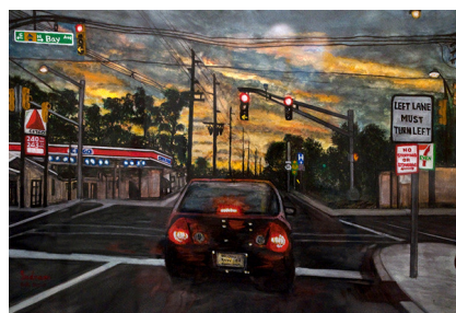
Indrani Choudhury - Crossroads Merit Award